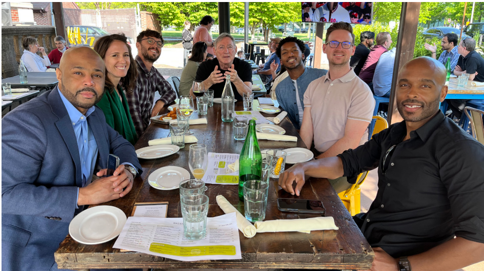
ASBN members enjoy an evening of networking and learning at our Philadelphia Regional Happy Hour on May 10.

Bringing our community together is at the core of ASBN's mission to inform, connect, and mobilize business leaders. In 2023, ASBN hosted four in-person events for 140 participants, and 10 webinars reaching 1,200 participants, in addition to our regional networking events.