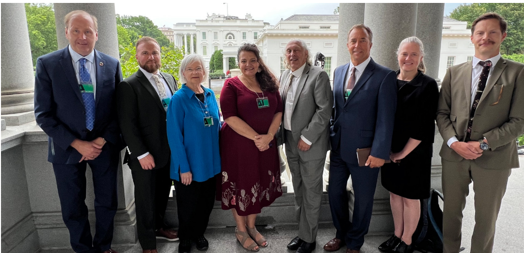
In June, ASBN staff and leaders meet with White House officials to discuss the implementation of the Inflation Reduction Act, the largest federal clean energy investment in American history.