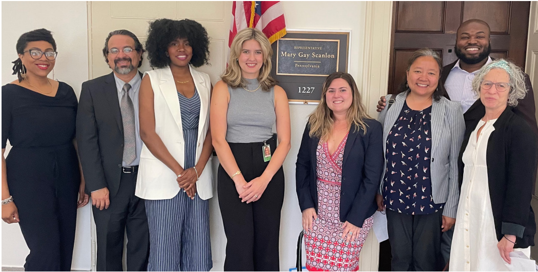
Members of ASBN's Pennsylvania delegation meet with U.S. Rep. Mary Gay Scanlon (PA-5) in June. The group included Farmer Jawn, All Together Now PA, National Family Farming Coalition, and PA Flax Project.

Vermont: Vermont Businesses for Social Responsibility (VBSR) held a successful Businesses for Climate Action lobby day at the statehouse. As a result, the state passed Act 76, which will invest $125 million annually in Vermont's child care and early childhood education workforce; the Affordable Heat Act, which will ease the transition to clean energy heating; and Paid Family & Medical Leave Insurance, which provides workers up to 12 weeks of paid leave.