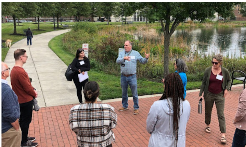
During the Delaware River Watershed Forum in September, the Wilmington Public Works department leads a tour of the Cool Spring Park Eco-trail, which provides a thriving community space as well as stormwater management.